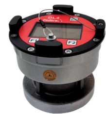
Drucklogger DL 4 with Storz-C